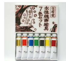
Wood-block Printing Paint