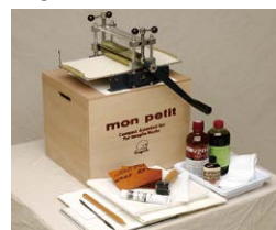
Etching Press Machine